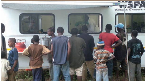
Local people watching surgical sterilisation through windows of mobile clinic on Zanzibar.

In 2006, there was a similar situation in Zanzibar when WSPA and the local government introduced a sterilisation intervention. It started with low compliance, with few owners willing to bring their animals for sterilisation. However, over a period of months, the education programme, discussions with key community leaders and actual examples of healthy sterilised animals began to create a change in human attitudes, leading people to actively bring their animals to be sterilised.