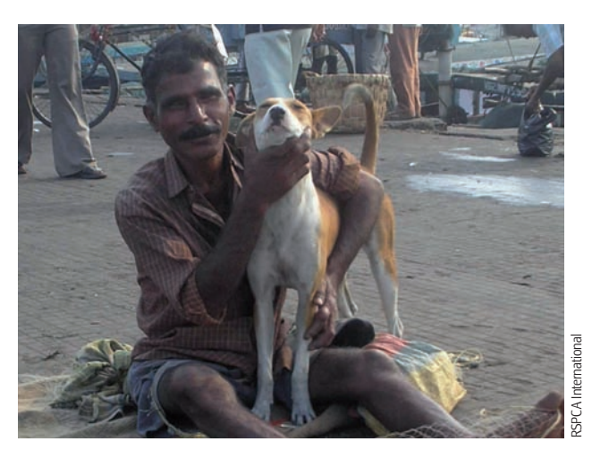
Fisherman and community dog in India.