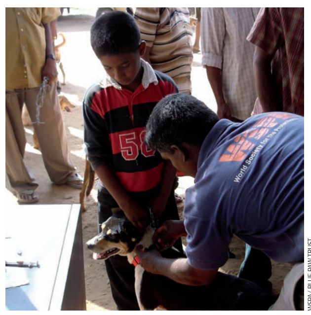
Fitting a red identification collar to a dog receiving rabies vaccination and parasite treatment in Sri Lanka

attention to the importance of preventative treatments and other population management tools. However, the risk of aggressive interactions and disease transmission between the large number of dogs that will attend needs to be mitigated by organising access and exits carefully, using a sterilised needle for each dog, and quarantining sick animals. Such camps will require adequate advertising beforehand. There is also a limit to the distance that the general public will travel for such a service, so thought must be given to the number of camps that would be necessary for the desired coverage, and the associated logistics.