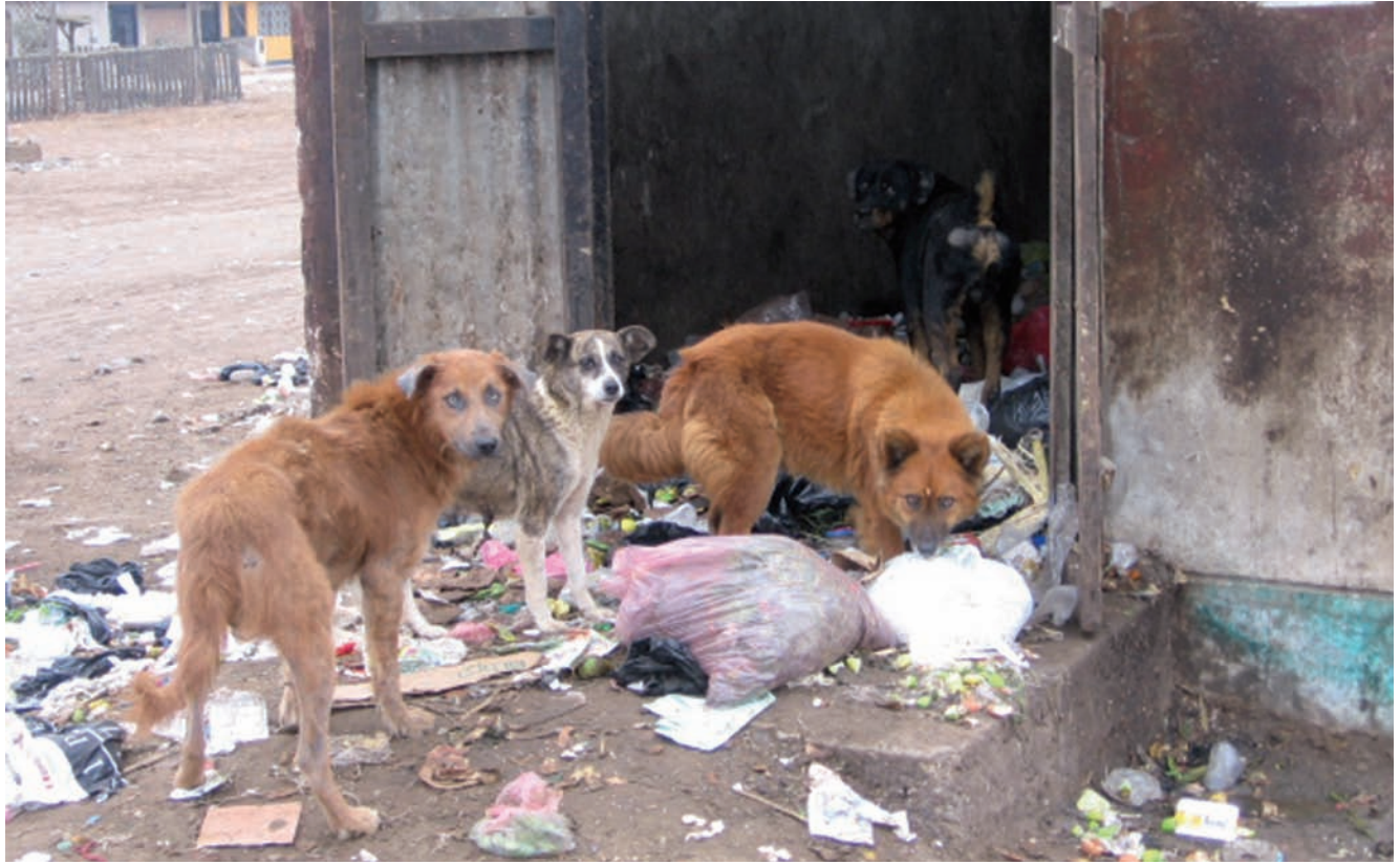
Roaming dogs feeding from rubbish in Peru