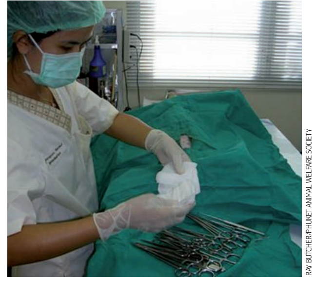
Surgery using aseptic techniques, Thailand.