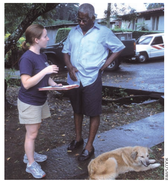
Pet owner survey in Dominica.

Attitudes and beliefs behind such behaviours may be hard to measure quantifiably (using a numerical regular scale). Discussions or open-format interviews with groups of people with relevant experience (such as dog owners or animal health workers) can help to bring out opinions. Keep these groups small and informal and allow free discussion around topics, using prompting questions to guide the discussion.