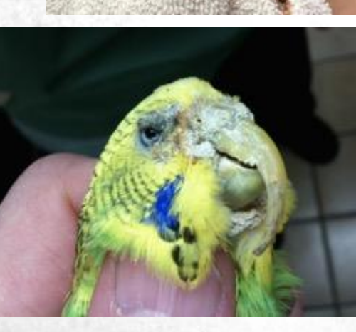
KNEMIDOCOPTES scaly face and leg mites >