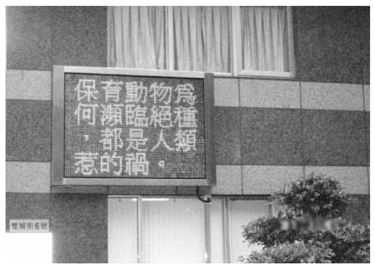
Electronic message outside the office of Committee of Chinese Medicine and Pharmacies, DOH promotes conservation. Messages have specifically urged people to use alternatives.

In only 7 instances were prices given per qian(3.75grams), fen(0.375grams)or for whole gall bladders: