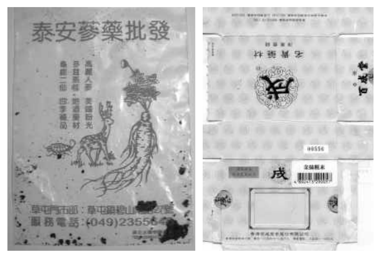
Examples of different packaging for bear bile products available for sale in Taiwan.