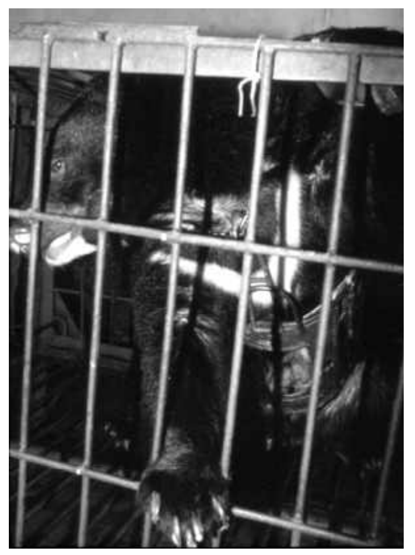
Bear wearing a metal corset on a Chinese bear farm. Some farms have bears permanently wearing these corsets which are used to help manoeuvre the bears in the cages during bile 'milking'.

from Chinese bear bile farms having a significant, is negative effect on global wild bear populations. In addition, an estimated 7,000 wild bears are held captive in extremely inhumane and cruel conditions, subjected to painful, daily bile extraction, for the lucrative bear farming industry.