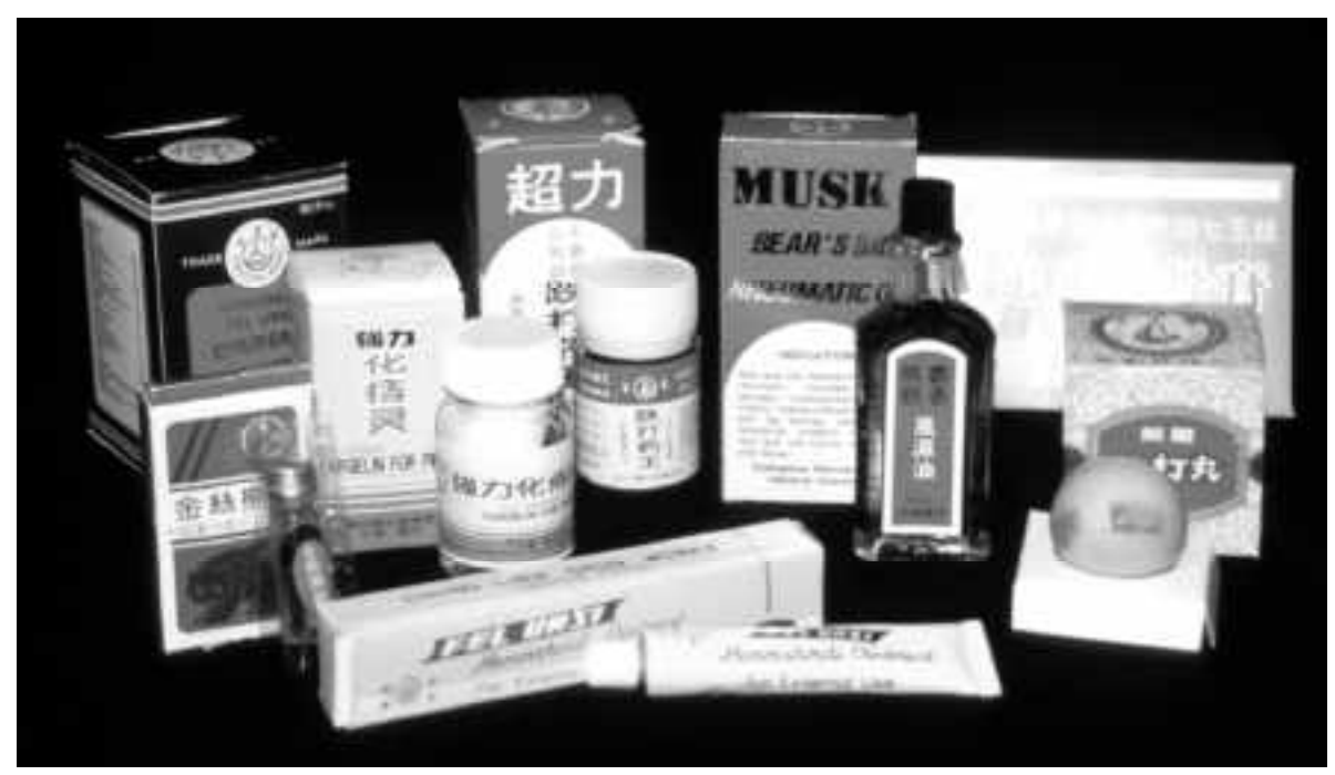
A wide range of bear bile products, mostly originating in China, that WSPA investigators discovered being sold in the USA and Canada.

The prices of bear galls were also seen to be much higher in several countries when compared to China. The prices of galls also varied according to whether they were sold by hunters or sold in city shops<sup>7</sup>. Since the gall of a wild bear is viewed as more potent in TCM than the bile from a farmed bear, with these price differentials the poaching of wild bears will continue as long as there is market demand and ineffective enforcement of legislation. A particularly large number of galls were observed in Malaysia (over 90 galls).