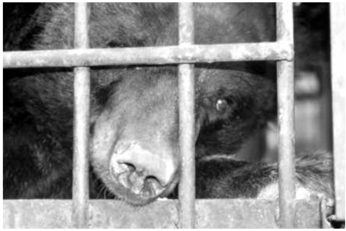
Products from Chinese bear farms, where conditions have been universally condemned by animal welfarists, were found throughout the world during WSPA's global study.

It is difficult to quantify the accurate numbers of wild bears killed for their galls, since only a small percentage of the illegally poached galls are seized by the authorities, either in the field or the market place. Accurate censuses of wild bear populations need to be carried out urgently to determine the real picture. However, the best solution would be to stop the demand from the international market.