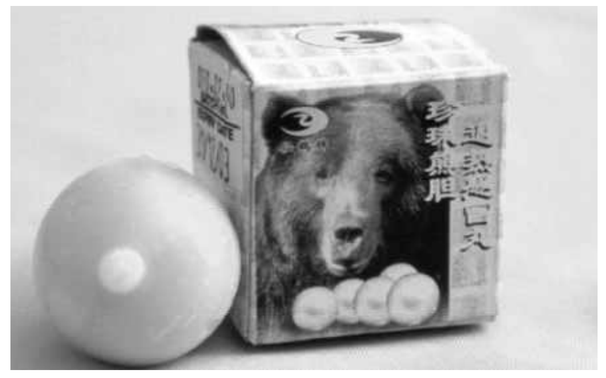
Bear bile product found in Malaysia.

legislation in some countries may protect the consumer against such misrepresented products, but in other countries there are no such safeguards in place. However, whether the galls are real or not, the sale of them still encourages consumption and increases the demand for bear bile and bear gall.